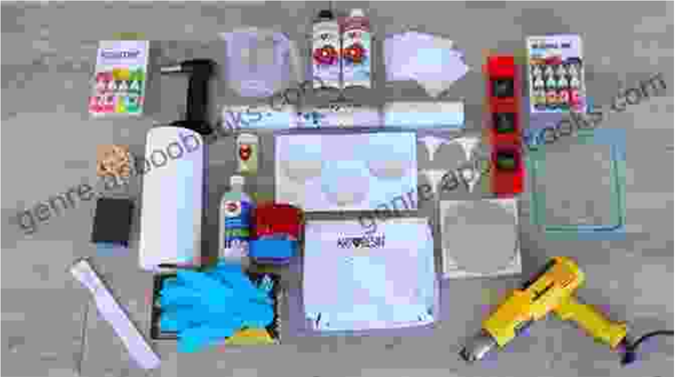
Epoxy resin essential tools