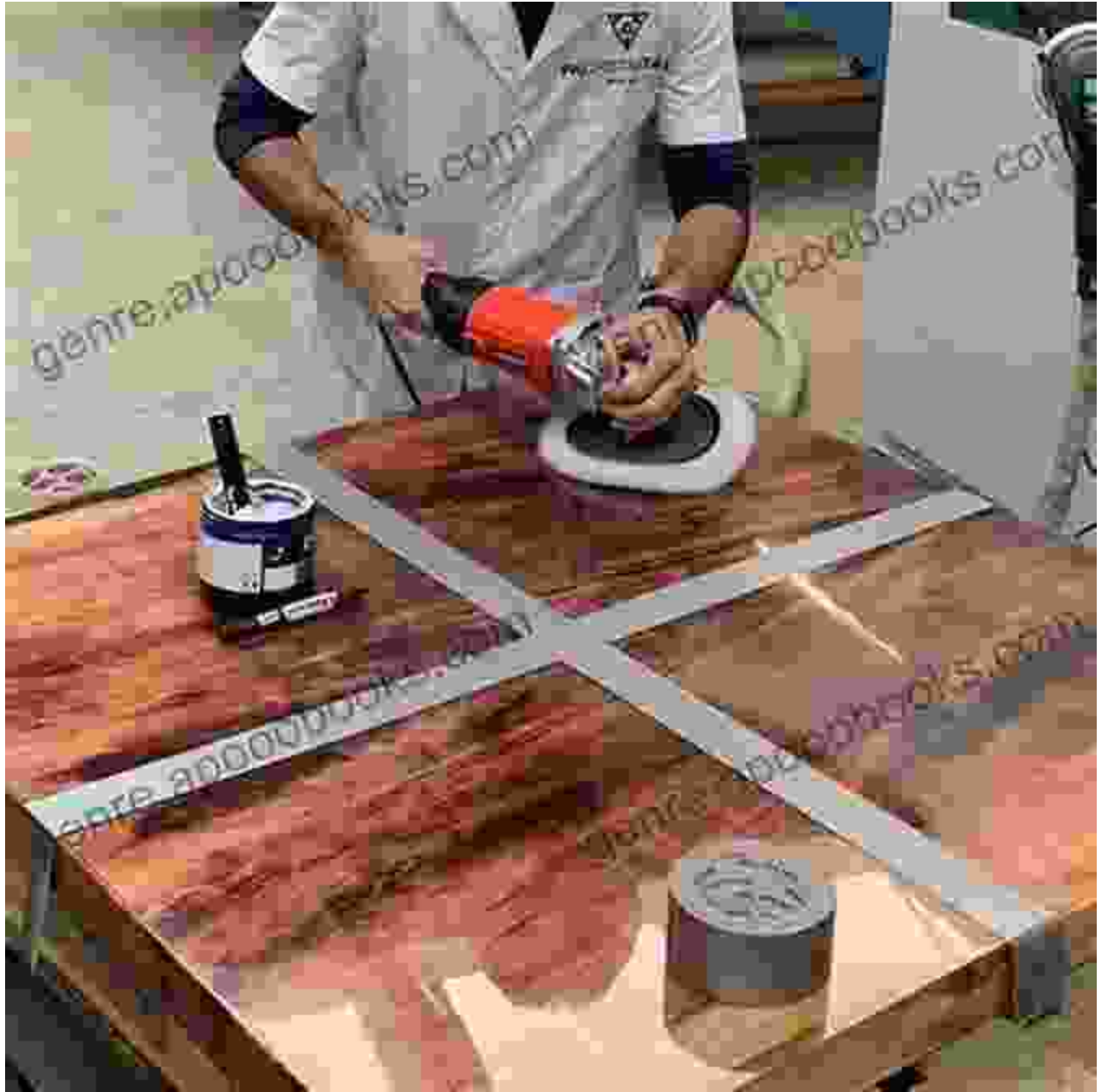
Epoxy resin finishing and polishing process