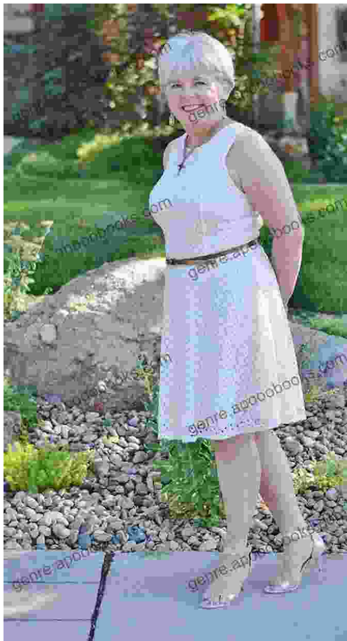
Image of the author