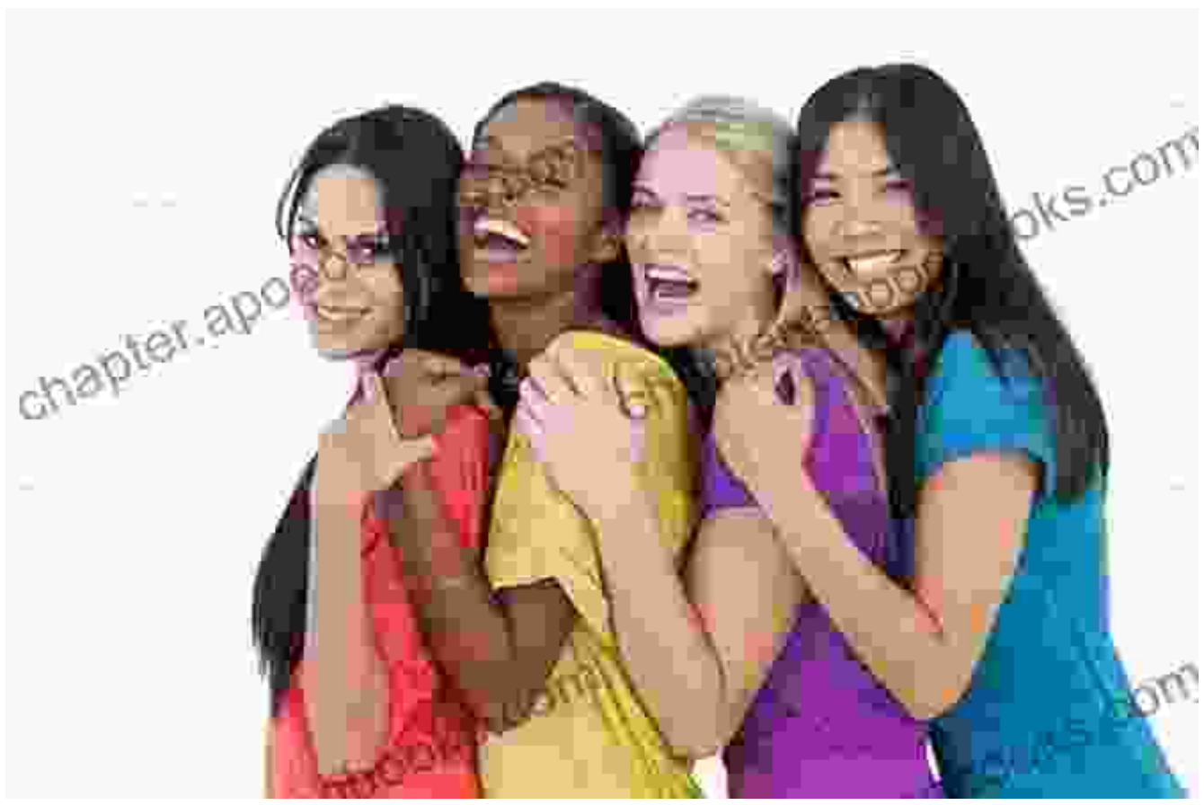
A Captivating and Thought-Provoking Theatrical Experience

'Daughterhood' is not simply a play but a transformative theatrical experience. Its powerful narrative, relatable characters, and evocative dialogue will captivate audiences from the very first scene. The play's intimate and thought-provoking nature invites viewers to engage with its themes on a deeply personal level, leaving them with a lasting impact long after the curtain falls. 'Daughterhood' is a must-see for theater enthusiasts, bookworms, and anyone seeking a meaningful and unforgettable artistic experience.