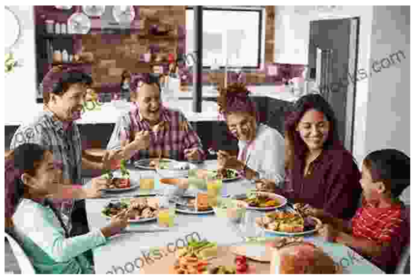
The Search for Identity and the Journey of Coming-of-Age

At the heart of 'Daughterhood' lies a profound examination of family dynamics. The play delves into the multilayered relationships between mothers and daughters, exploring the intricate web of love, conflict, and unconditional bonds. Through its compelling characters and authentic dialogue, 'Daughterhood' invites audiences to reflect on the complexities of family life, the challenges of growing up, and the enduring power of familial love.