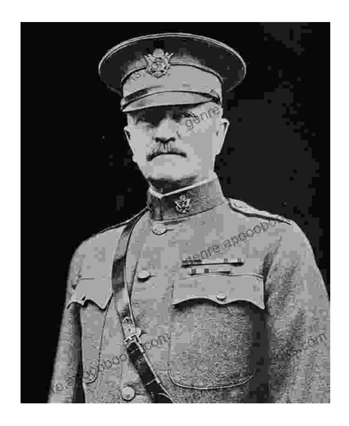
Epic Battles and Unwavering Courage: The AEF in Action

The book transports readers to the heart of the most iconic battles of World War I, where the AEF's valor and sacrifice left an indelible mark. From the bloody trenches of Belleau Wood to the decisive Meuse-Argonne Offensive, the narrative captures the heroism and resilience of the American soldiers.