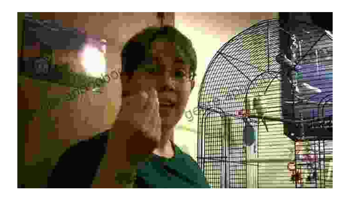
Figure 3: Target training is an advanced taming technique.

Target training involves teaching your budgie to touch a specific target, such as a stick or perch. This technique is useful for reinforcing desired behaviors, teaching tricks, and providing mental stimulation for your bird. Target training requires patience and consistency, but the rewards are well worth the effort.