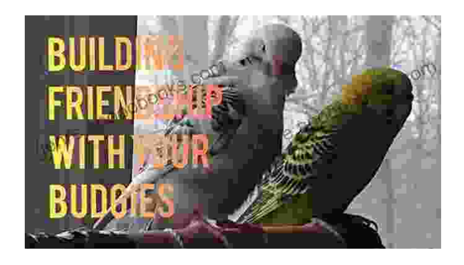
Figure 2: Building trust is essential for successful taming.