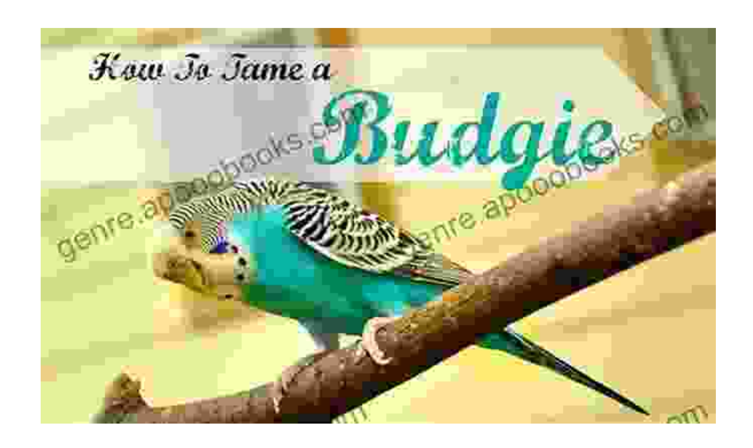
Figure 4: Tame budgies excel at expressing themselves.